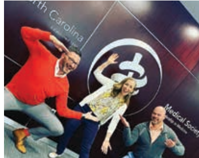
@unmutedlife • Here's to saying YES before we know all the answers. Here's to following our dreams and taking risks that make us feel alive. Here's to gratitude for people who see things in us before we see them in ourselves.