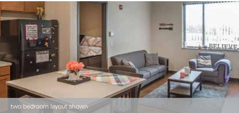
two bedroom layout shown