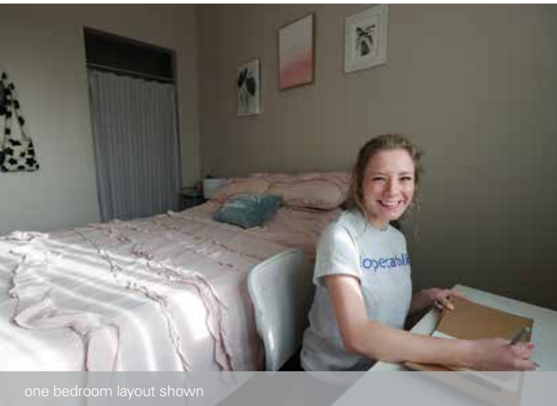
one bedroom layout shown