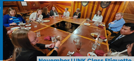
November LUNK Class Etiquette Lunch at The Alley Rose