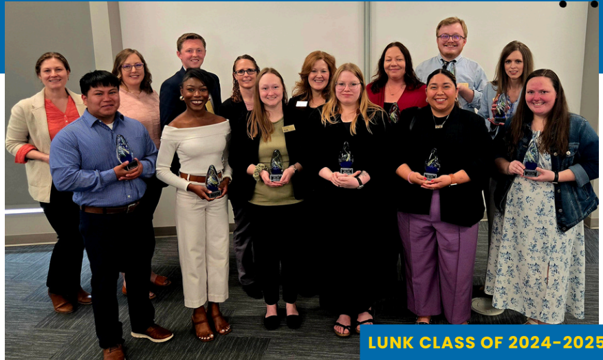
LUNK CLASS OF 2024-2025