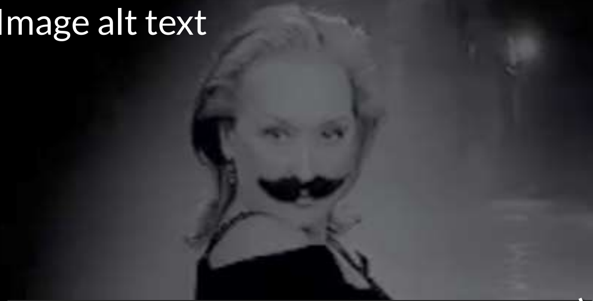
GIF: In a mysterious smoke-filled space, actress Meryl Streep turns toward the camera to reveal she is wearing a large false mustache.