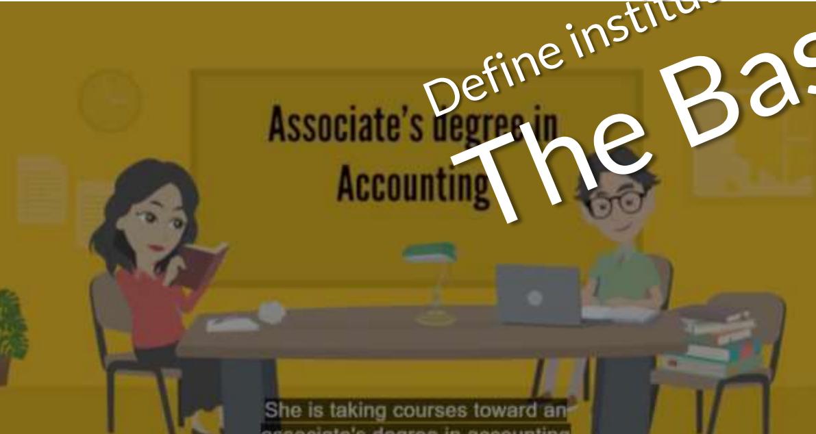
She is taking courses toward an associate's degree in accounting