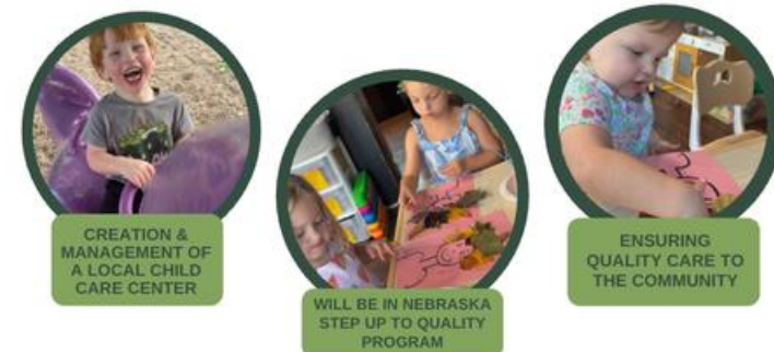
CREATION & MANAGEMENT OF A LOCAL CHILD CARE CENTER

Planting a solid foundation for future growth. The campaign goal is taking into account the costs to renovate the facility and ensure long term sustainability.