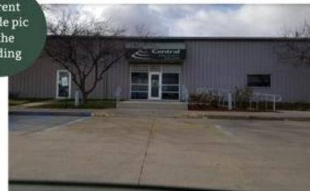
Current outside pic of the building

Total Renovations & Start-up Plan: $192,572