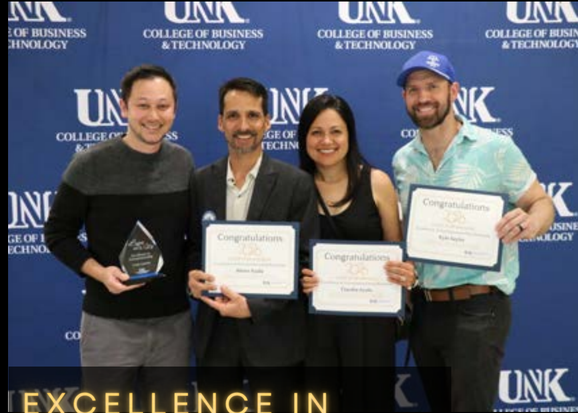
EXCELLENCE IN ENTREPRENEURSHIP