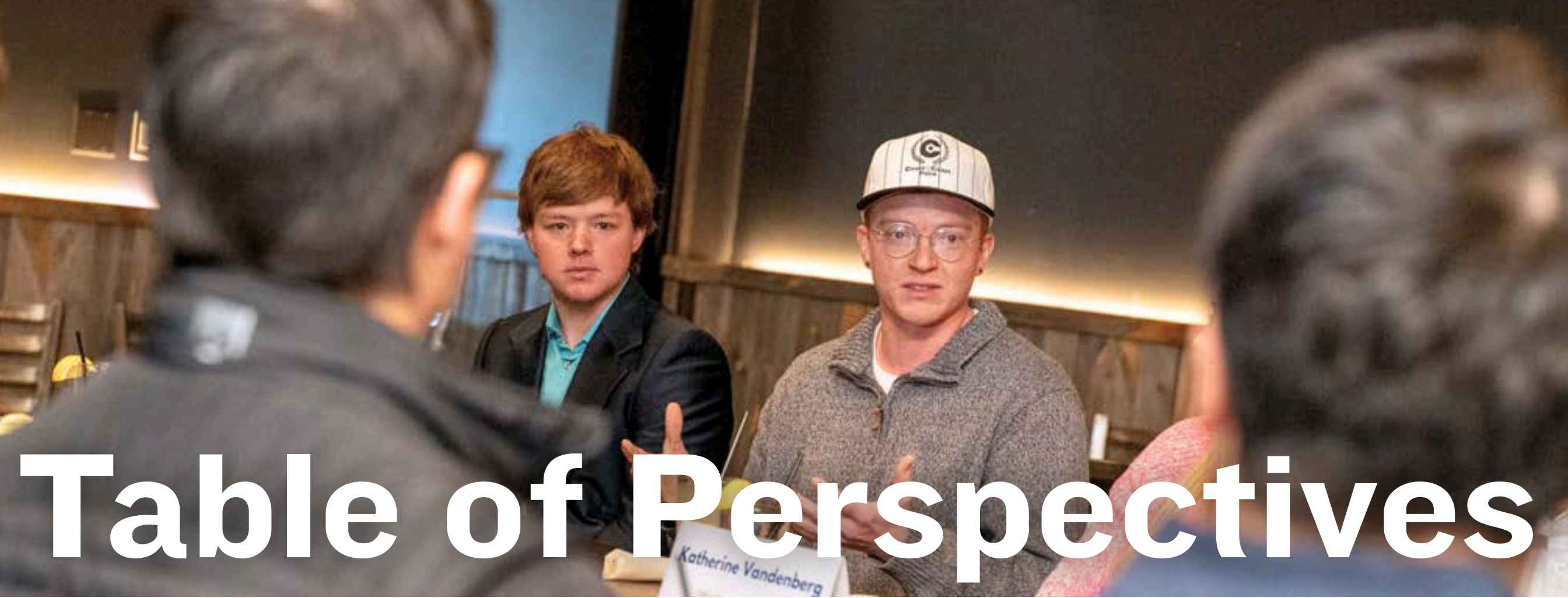
Table of Perspectives

Inspired by Thomas Jefferson’s tradition of intimate, idea-driven gatherings, Table of Perspectives creates a relaxed, welcoming space for meaningful conversation. Over a shared meal, students and business leaders exchange experiences, challenge assumptions, and consider how business and education can better serve individuals and communities. Each guest is given three minutes to share a “pit” and a “peach”—a challenge (“pit”) and a moment of pride or joy (“peach”) related to business or education.