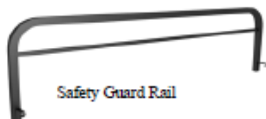
Safety Guard Rail

It is critical to always have the steel bunking pins inserted into each post when lofting the wood ends. It is also critical to be sure that the wood ends are lifted off the bunking pins when disengaging the wood ends as tilting the wood end can damage the wood end if it is still resting over the steel bunking pin. Lifting the wood end up off the bunking pins during any reconfiguration of the loft units will avoid this damage to the wood ends.